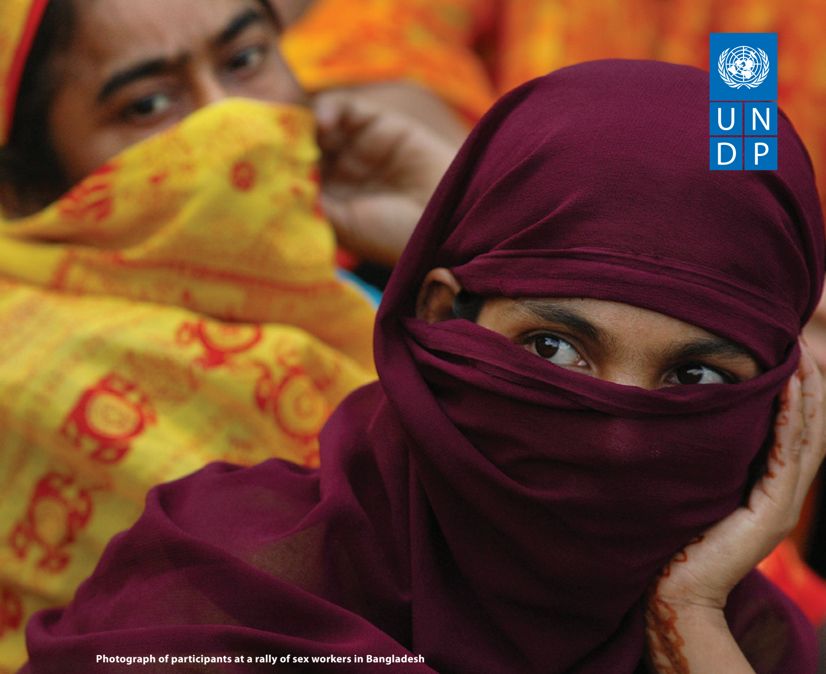
Photograph of participants at a rally of sex workers in Bangladesh